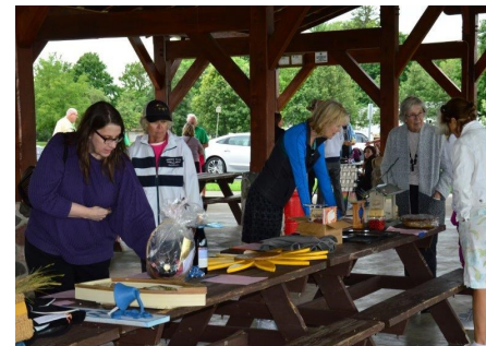
Silent Auction raised $488.00 from 23 Contributors from SCLC Lake Reps