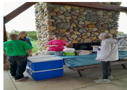
Chicken BBQ from Land of Lakes Lions