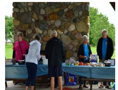
SCLC Lake Reps assist with Food Table