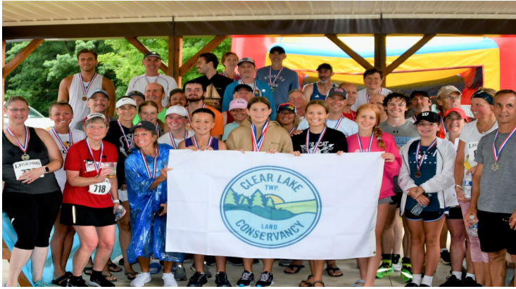
Age group winners at the Clear Lake Fun Run.

Continued From Page 15—Clear Lake Land Conservancy